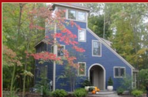
Acadia I & II